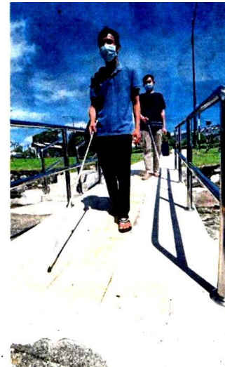
Six ramps were constructed in Taipan USJ following the MS 1184:2014 Malaysian standard for the benefit of disabled pedestrians in the area.