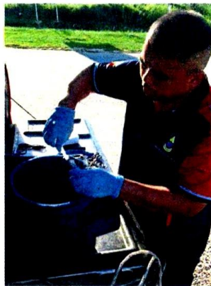
An officer from Luas taking water samples from Sungai Gong in Rawang earlier this week, to be sent to the Chemistry Department for testing.

The odourless discolouration is suspected to have been from IWK's GBK 134 Area 5 sewage treatment