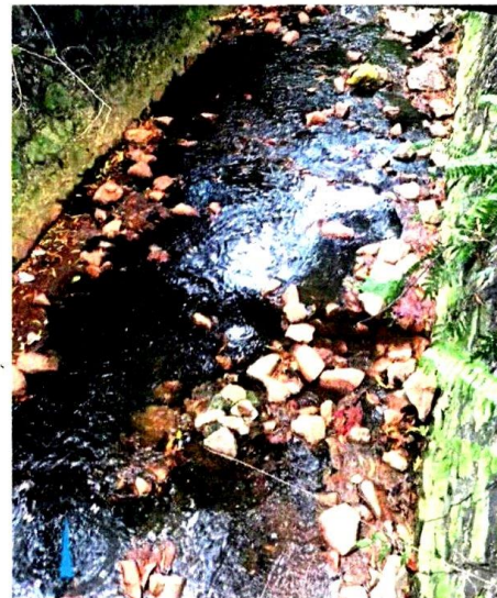
A black odourless discolouration of Sungai Gong in Rawang is suspected to have been caused by dyes.