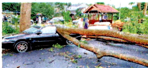
POKOK tumbang turut menghempap sebuah kereta milik penduduk di Desa Pinggiran Putra pada Selasa lalu.

Selain itu, kejadian sama turut menyebabkan bekalan elektrik di beberapa kawasan terputus dan jalan utama masuk ke taman perumahan juga terhalang disebabkan pokok tumbang.