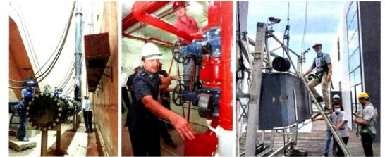
Ww technical staff inspecting the sewerage works in a building for the issuance of Clearance letter required by the developer for the CCC. A Fire and Rescue Department enforcement officer checking a pressure gauge during a fire safety inspection. Architects and engineers checking on the fitness of a building to provide clearance letter in accordance with the Uniform Building By-Laws for the issuance of CCC for the project's subsequent period.